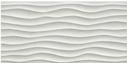
Dune CT12-8DUW Matte Finish