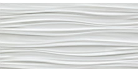
Ribbon CT14-8SBW Matte Finish