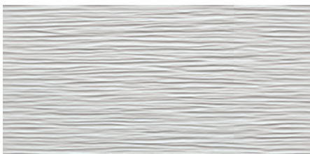
Wave CT13-8DWG Glossy Finish