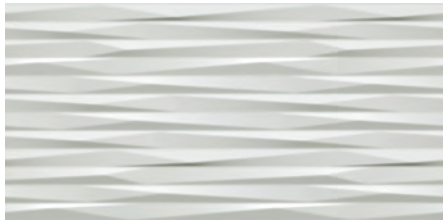
Blade CT11-8DBW Matte Finish