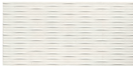
Whittle CT16-A575 Matte Finish