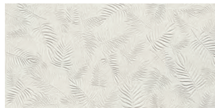
3D Leaf CT17-A578 Matte Finish